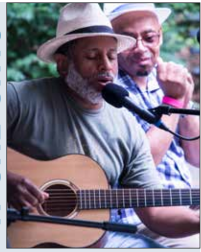
2016 DC Blues Festival pages 4 and 5