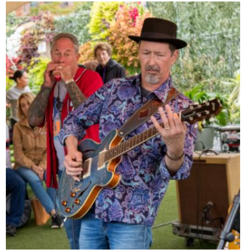
The Nighthawks headlined the Annual DC Blues Festival at the Wunder Garten.

DCBS - Celebrating the blues in DC, MD, & VA for over 32 years!