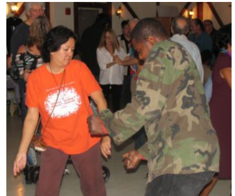
DCBS loves its dancers!