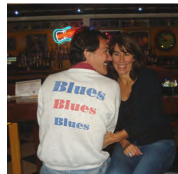
Blues fans showing off their historic DCBS merchandise