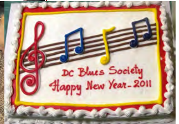
DCBS New Year's Eve Party