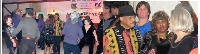
To see many more pictures of the DCBS New Year's Eve Dinner & Dance visit: http://www.flickr.com/photos/28294197@N05/sets